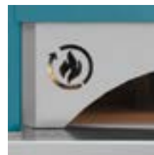
Custom Brand Panel and Custom Arch Doorway (add your logo to both)