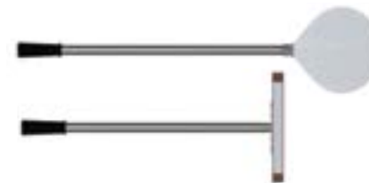
OneRev Tool Set