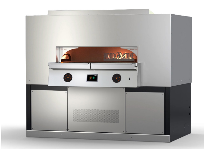
WS-FA-9660 Shown with optional Decorative Flame