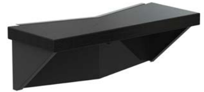
Mantle Bracket: Black Powder Coat Finish