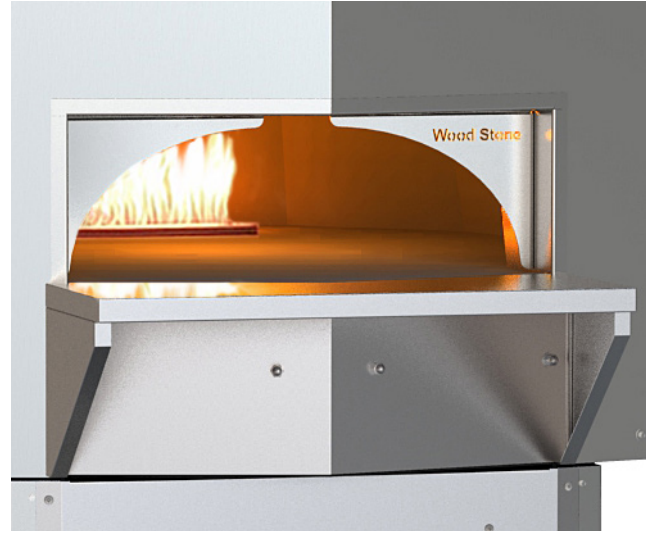
WS-MS-5-RFG-IR model with stainless steel Mantle and stainless steel Mantle Bracket shown.

If you are planning to build your oven into a facade wall, please visit the Facade Tutorials section on the Wood Stone website.