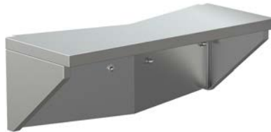
Mantle Bracket: S/S Finish