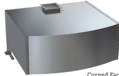
Curved Face Hood