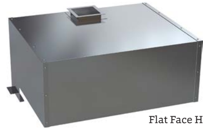
Flat Face Hood

The hood can be used in conjunction with an Exodraft exhaust fan (see previous page) to create an effective and responsive exhaust system. All duct work beyond the ventilator duct take-off collar is to be provided and installed by others in accordance with applicable codes.