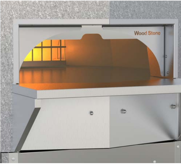
Specialty Arch, Low Arch Wide shown.