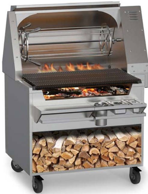
Right-Hand drive Okanogan Rotisserie with optional Multi-Skewer Drum assembly. Shown on Mt. St. Helens (SFB) Charbroiler with optional Pan Rail and Shelf.